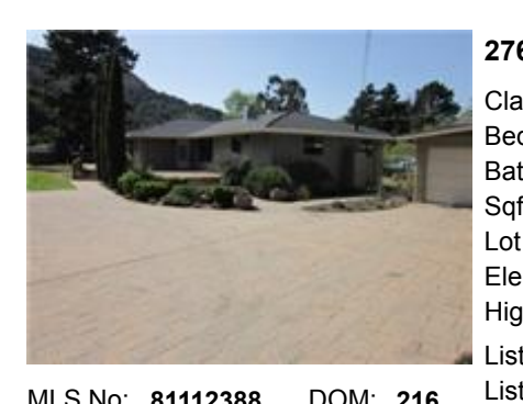
DOM: 216 MLS No: 81112388 Status: Sold