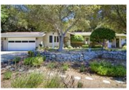
MLS No: 81119329 DOM: 193 Status: Sold