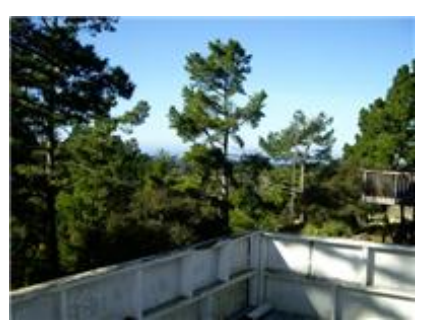
MLS No: 81203611 Status: Sold

many years and is in need of major repair. Lots of Water Credits