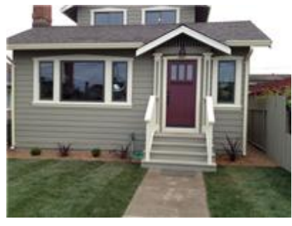
MLS No: 81205241 Status: Sold

short steps puts you on the walking path near Lovers Point. Ocean views from the kitchen and living room. Three bedrooms and two baths, maple