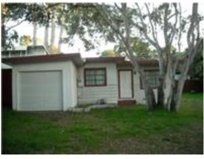
MLS No: 81202460 Status: Sold

distant ocean views), yet conveniently located near shopping and access to Hwy 68. The brick fireplace is the focal point of this 1100 sq ft 2 bed 1 bath