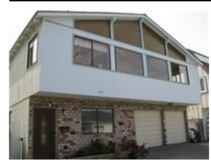
MLS No: 81140265 Status: Sold

Conveniently located, short drive to beaches and shopping.