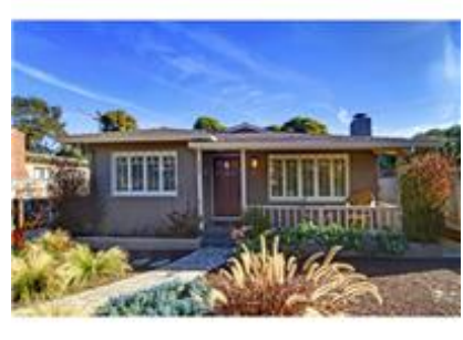
MLS No: 81200823 DOM: 28 Status: Sold

single-level home with a private master suite, two additional bedrooms, two luxurious baths and a family room with custom built-ins and fireplace.