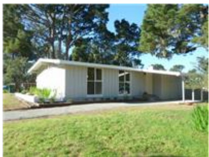
MLS No: 81205062 Status: Sold