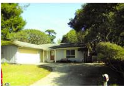
MLS No: 81145673