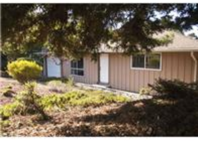
MLS No: 81145434