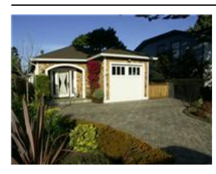
MLS No: 81150787 Status: Sold