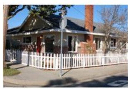
MLS No: 81201314 Status: Sold