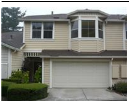
MLS No: 81137303

LAST HOMETOWN" HAS TO OFFER - JUST BLOCKS TO DOWNTOWN, WASHINGTON PARK & OCEAN FRONT. NEW FLOORING, INTERIOR &