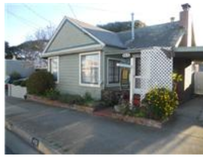
MLS No: 81203957

Two Master suites both with full bathrooms and offices/bonus rooms. Hardwood floors, breakfast bar, 2 car garage and gated community.