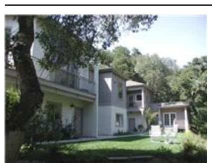
MLS No: 81151376

Carmel Valley neighborhood. Recent remodel/tastefully done with a terrific open and inviting floor plan. 4 bedrooms 3 full baths. Blue sky, sunshine &