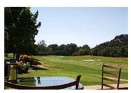
MLS No: 81206683 Status: Sold

sale, this home provides a wonderful opportunity. The rooms are open, light and airy. Upstairs features a wrap-around deck for enjoying the serene