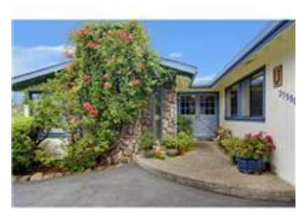
MLS No: 81133207

half levels reflect careful architectural planning for the site. Wonderful