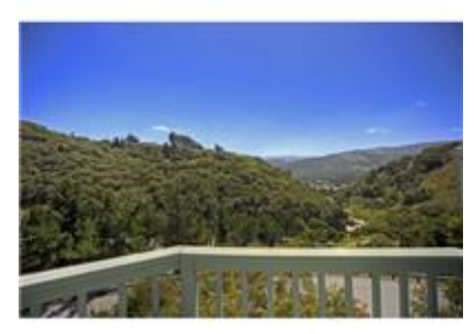
MLS No: 81127915 Sold Status: