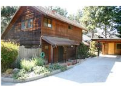
MLS No: 81212702 DOM: 1

location - convenient to Del Mesa amenities. Pull down ladder for access to attic storage area. Washer/dryer in unit. New deck and railings off LR/DR.