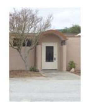
MLS No: 81203825 DOM: 9