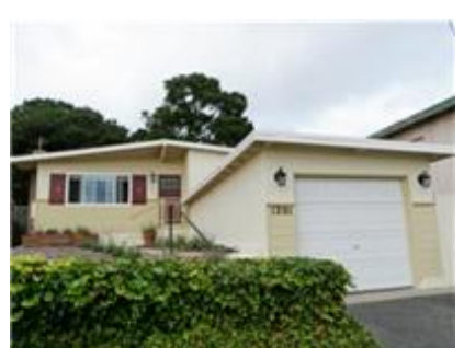
MLS No: 81205587 Status: Sold

Nicole Truszkowski Page 6 of 6 Client Thumbnail