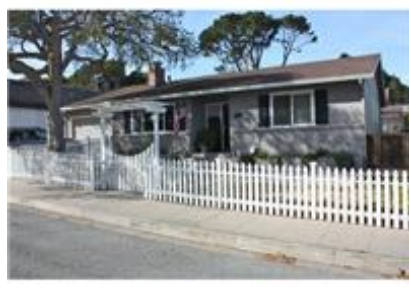
MLS No: 81211288 Status: Sold

fireplace, travertine marble counter tops and floors and up-to-date