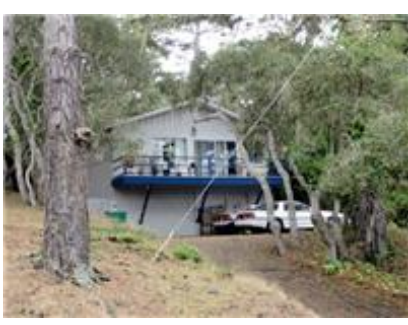
MLS No: 81143718