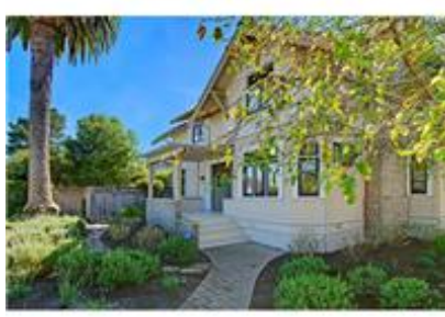
MLS No: 81206437 Status: Sold

rm. Upstairs family rm w/roof top deck w/ocean views. Master ste