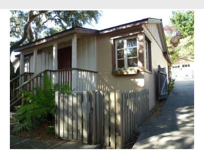
81221055 DOM: 95 MLS #:

open to carrying a second or a lease option.