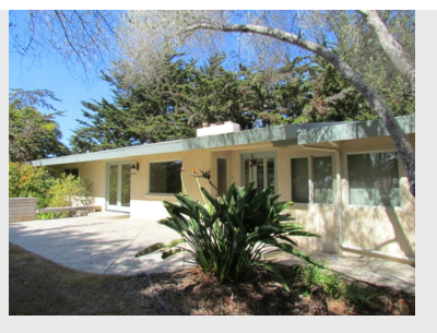
MLS #: 81237806 DOM: 14

of other credit decisioned financing or a NACA letter.