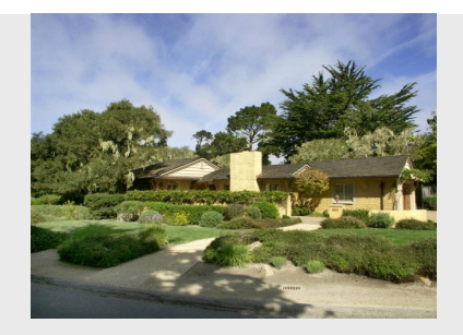
MLS #: 81238022 DOM: 27

enjoyable outdoor living. Short walk to MPCC.