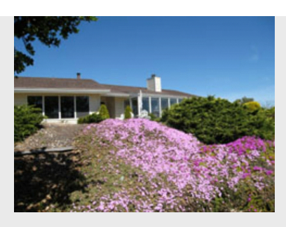
81212949 DOM: 183 MLS #:

bedrooms, 3 baths, 2 atriums, hobby room, 2 car garage, 2.97 site.