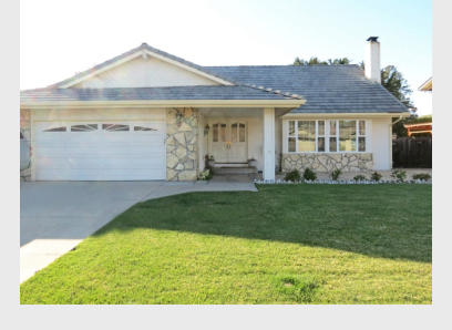
MLS #: 81308012 DOM:0 Status: Sold