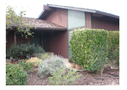
MLS #: 81305113 DOM: 40 Status: Sold