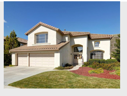
MLS #: 81305746 DOM:24 Status: Sold